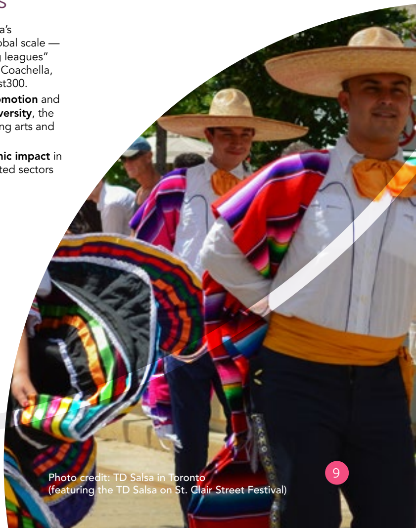
Photo credit: TD Salsa in Toronto (featuring the TD Salsa on St. Clair Street Festival)